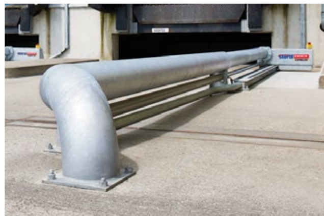
Easy to install above ground.