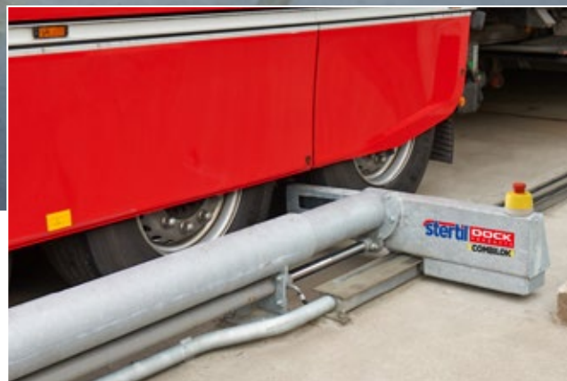
No damage to mudguards or side skirts due to the low height of the wheel block.